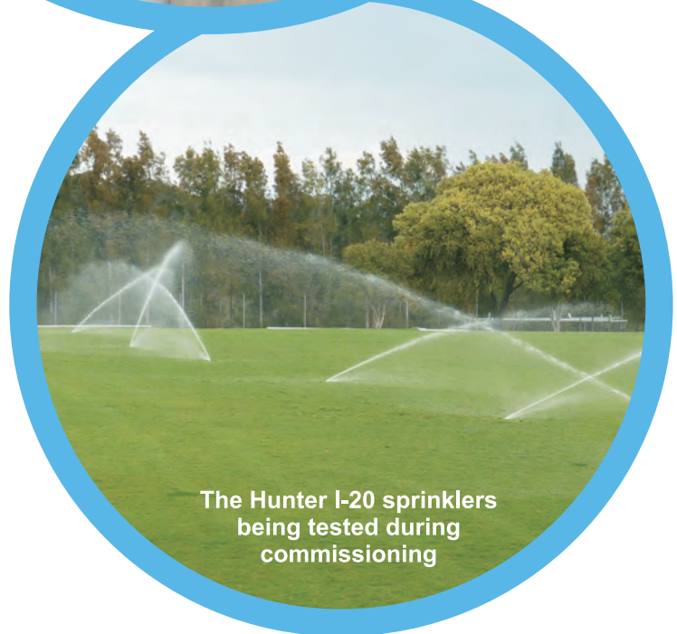
The Hunter I-20 sprinklers being tested during commissioning