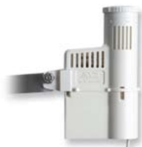
Wireless Rain-Clik Sensor

The first reliable wireless rain sensor provides fast installation on any system