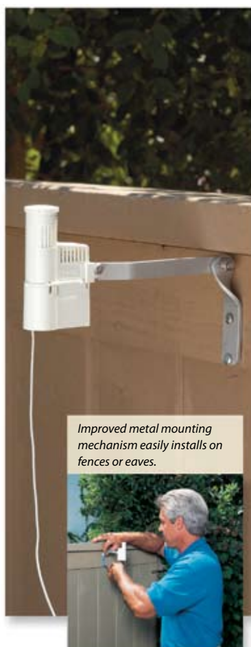
Improved metal mounting mechanism easily installs on fences or eaves.