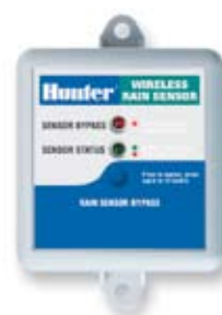
Wireless Rain-Clik Receiver

If the thought of running wires from a controller has kept you from adding rain sensors to your systems, now there's a hassle-free alternative. The Hunter Wireless Rain-Clik™ attaches quickly and easily—simply install the receiver unit next to your irrigation controller, then install the transmitter anywhere that the device can receive representative rainfall. No ladders needed to attach to a high outcropping on a building, no messy wires to hide out of view. What also sets a Hunter Rain-Clik apart